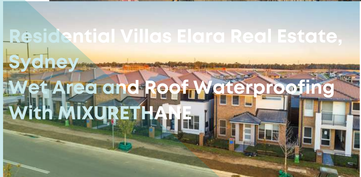
Residential Villas Elara Real Estate, Sydney Wet Area and Roof Waterproofing With MIXURETHANE