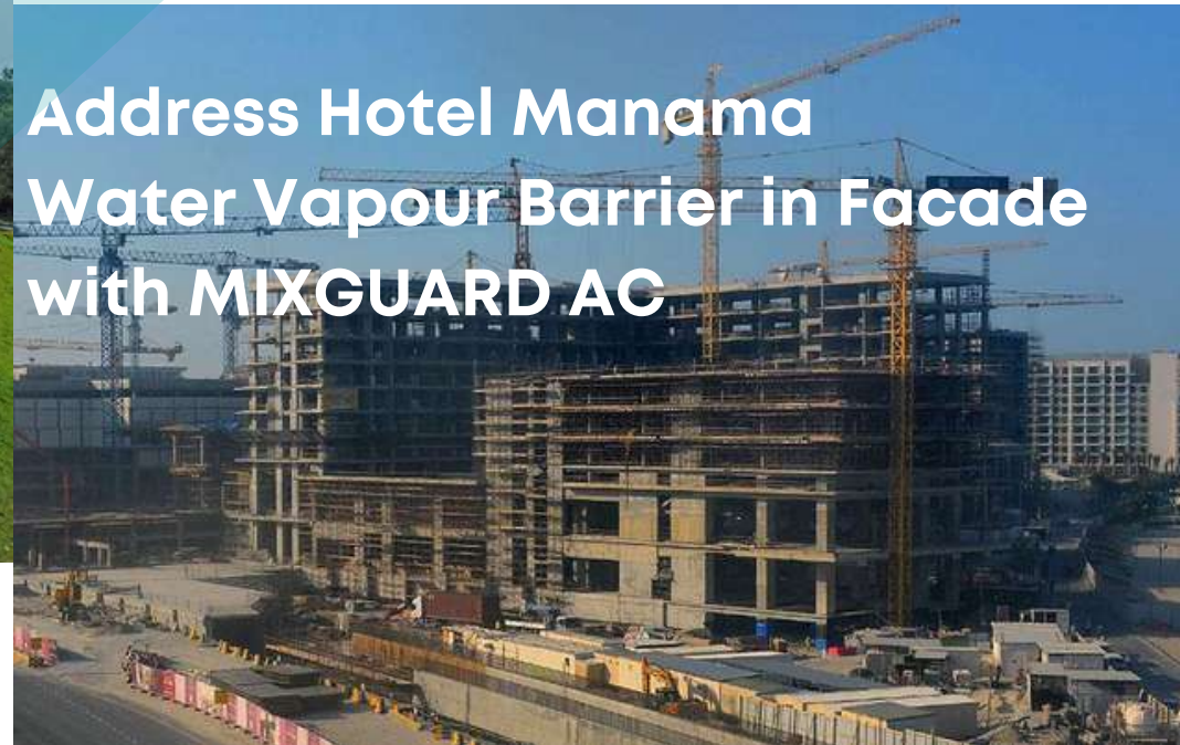
Address Hotel Manama Water Vapour Barrier in Facade with MIXGUARD AC