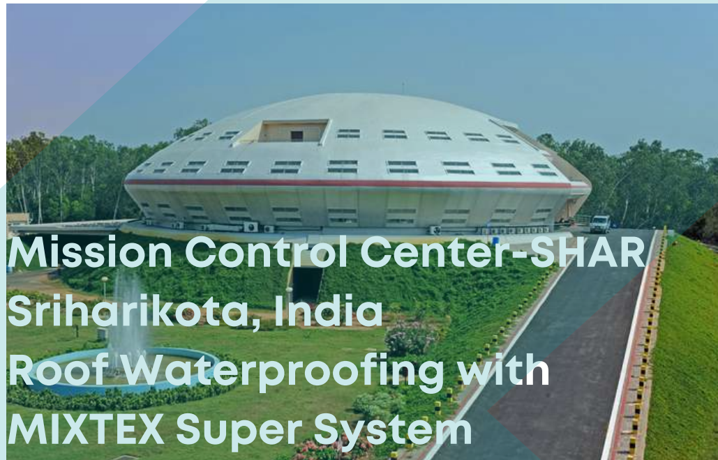
Mission Control Center-SHAR Sriharikota, India Roof Waterproofing with MIXTEX Super System