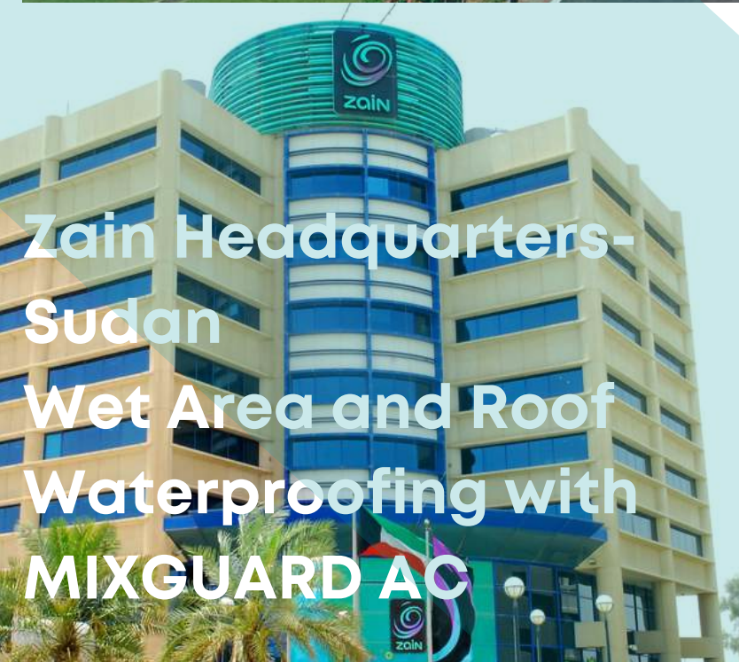
Zain Headquarters- Sudan Wet Area and Roof Waterproofing with MIXGUARD AC